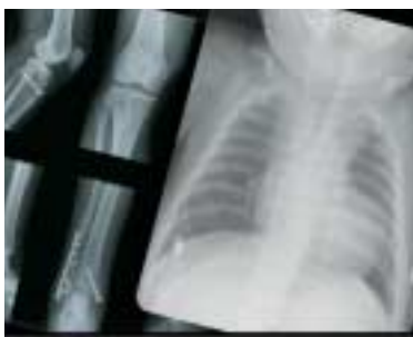
High resolution of 508 ppi