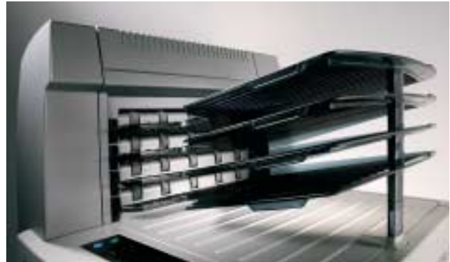
Unique sorter eliminates high-traffic bottlenecks