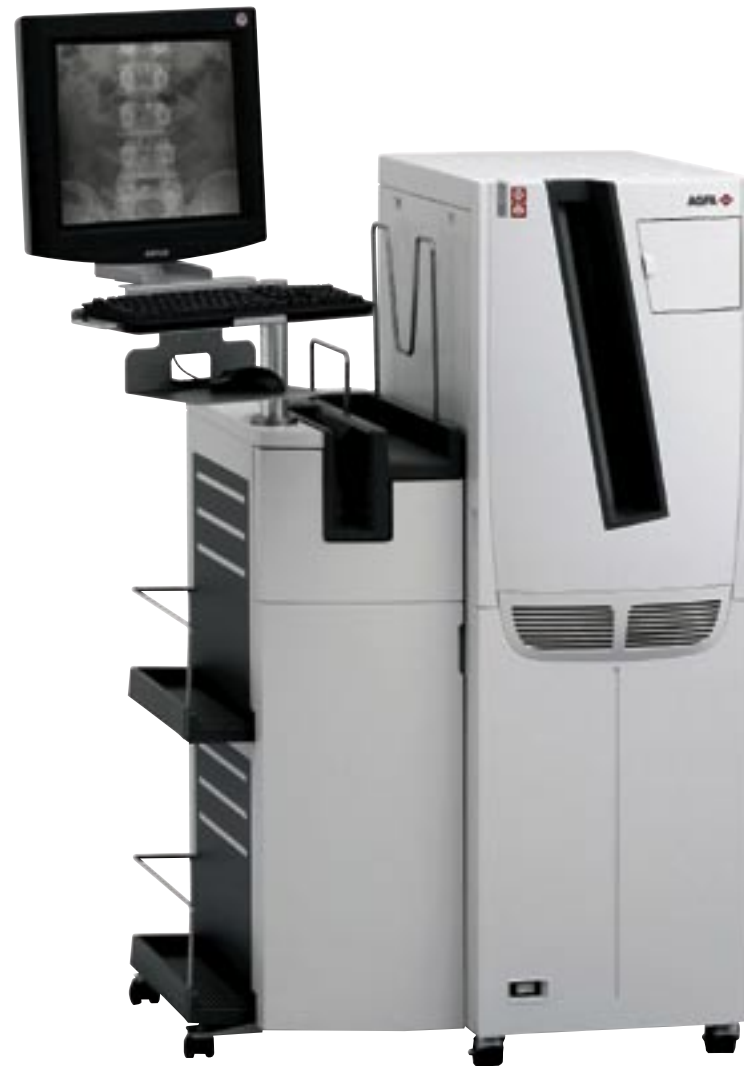
Quantum/Agfa CR25.0L, shown with optional CR User Station, which provides space for workstation, Cassette ID functionality and cassette storage.