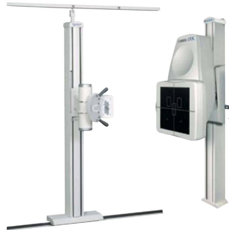
Chiro-DX Wall Stand

DR (Direct Radiography) is now available and affordable to the chiropractic professional. Quantum's advanced technology incorporates CCD Technology (Charged Couple Device) on the wall stand for efficient and cost effective solution. The Chiro-Dx system produces images in less than six seconds without the need for cassettes.