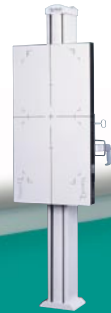
QS-506 Tubestand with VERTI-Q 14" x 17" Vertical Wall Stand (QW-420) and Mobile Table (QT-710)